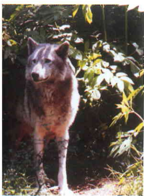
M'ijo.

M'ijo showed no apparent signs of illness. He was found one morning by Animal Care Staff collapsed on the ground and was rushed to the emergency Vet. During a medical exam blood was found in his ab-