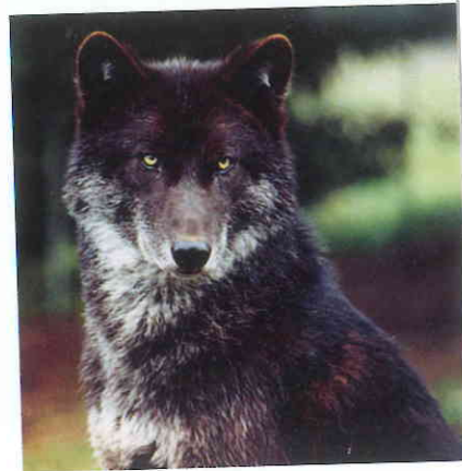
Above: Onyx as a youngster Center: Wolf Haven fir tree

I sat with him the whole afternoon while the sedative wore off, worrying that he would never forgive me. I gently stroked his head as he tried to watch me through groggy eyes while drifting in and out of a hazy sleep. Each time I took my hand away, he